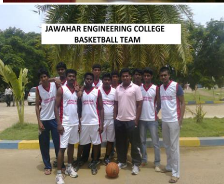
JAWAHAR ENGINEERING COLLEGE BASKETBALL TEAM