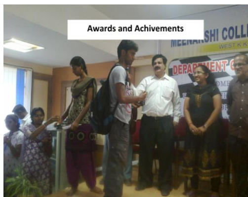
Awards and Achievements