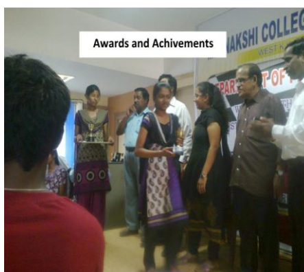
Awards and Achievements