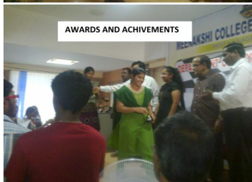
AWARDS AND ACHIEVEMENTS